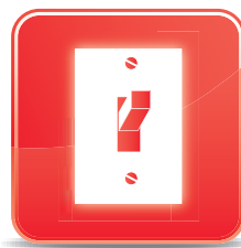
Emergency Power Supply